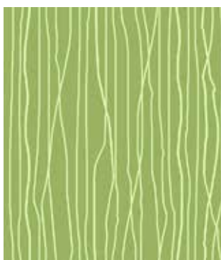
7884-TG 1 yd