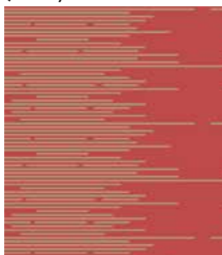
7883-R ¾ yd