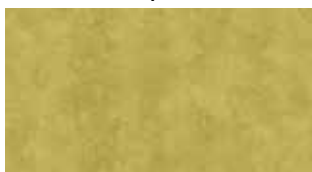
5468-Y ½ yd