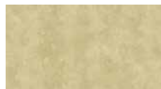
5468-LN ⅛ yd