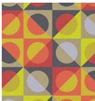
7882-R 1½ yds (extra yds needed for backing)