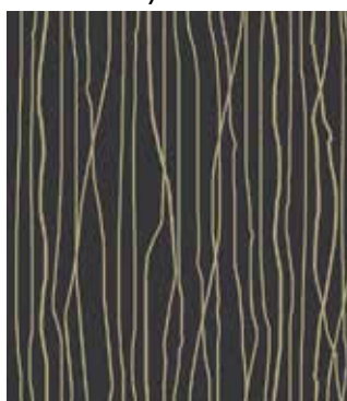
7884-RK ½ yd